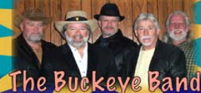
The Buckeye Band