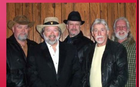
The Buckeye Band